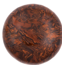
Ceramic pg. 7B