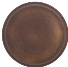
Hand Antiqued Brass