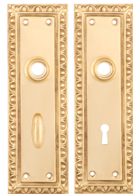
Privacy Turn Mortise