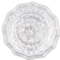
Glass pg. 7C