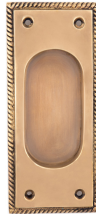
Hand Antiqued Brass